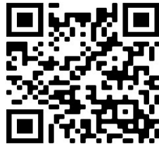
QR Code for Hospital Location