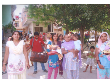
South West District