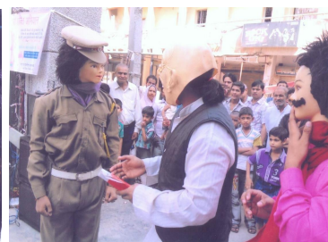
Inderlok DGD (North)