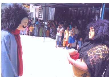
Madanpur Kapar (North)