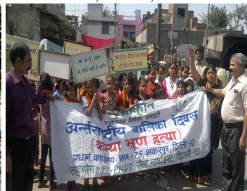
North East District