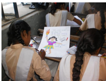
Poster Competition North East District