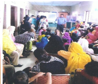
North east District