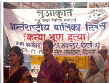
North East District