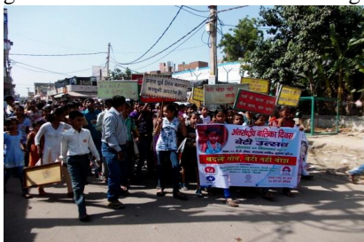
North West District

There were total 15 Rallies conducted by the district in the Delhi State. Providing message, through the Rally to the community with different slogans e.g. 'Daughters are blessings not a burden', 'Don't destroy future by killing girl child', 'Save the girl child' etc. The aim was to sensitize students towards this social ill and to create awareness among people to prevent female foeticide, to prevent child marriages so that girls have an assurance of well-being in education, health, socio-economic conditions and family relation.